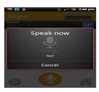
Fig 2. Skyvi main menu